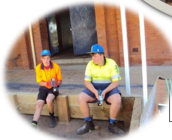
Year 9 TAFE team busy at work revamping the Ken Eggleton Memorial Garden